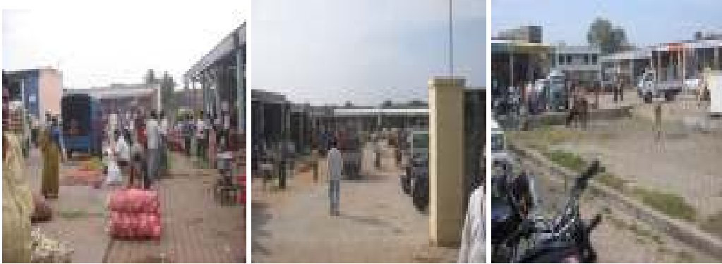
View of Wholesale market for Fruits & Vegetables at Shimoga. Display board is to be placed. Cattle is roaming freely inside the market area.