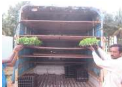
Vegetable seedling production by Ms Netravati. The vegetable seedlings fetch a price of Rs. 0.2 to 0.3 per plant.