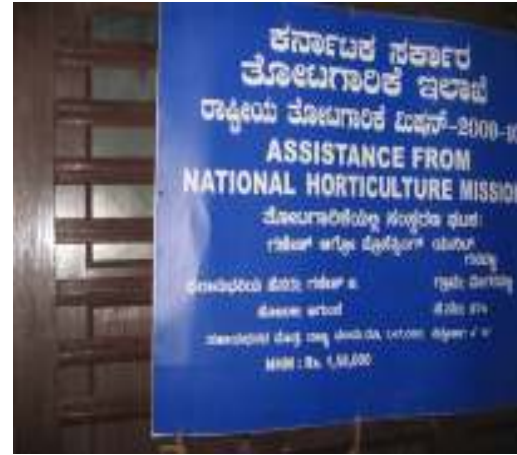
Primary processing unit for spices set up at Megaravalli by Shri Ganesh Ganavalli during 2008-09